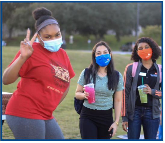
Students at Cultural Outing.

The strength of the Honors Community at SHSU relies on the bounding broad intellectual, academic, cultural, and social stimulation and engagement of our students year to year.