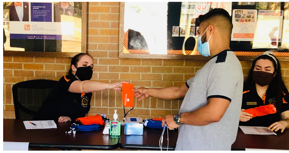
Photo of Fall 2020 Honors Mask & T-Shirt Giveaway

A Member of The Texas State University System