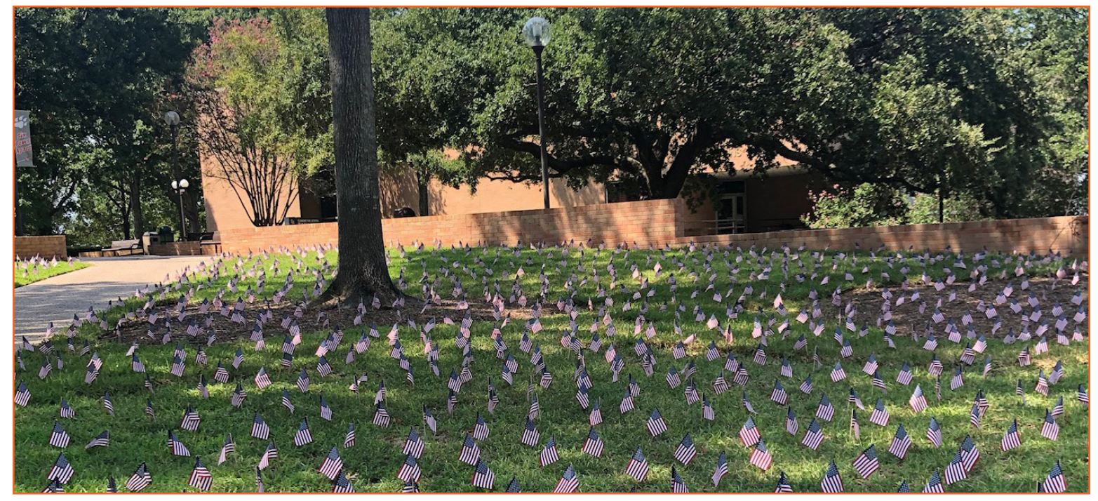
Photo of the 2,977 American flags planted for 9/11 Remembrance Project